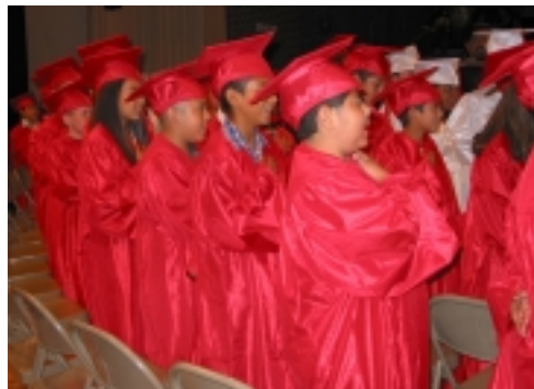
Sunset Elementary graduates prepare to receive their certificates.