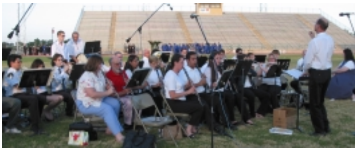
The Community Band provided music for the event.

Over 100 graduates participated in ENMU-R's 41st commencement on Thursday, May 6, at the Roswell Wool Bowl. As well as associate's degrees being awarded, bachelor's and master's degree candidates received their diplomas.