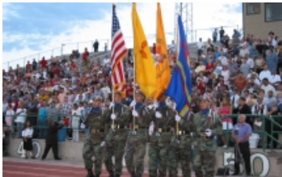
The New Mexico Youth Challenge color guard presented colors.