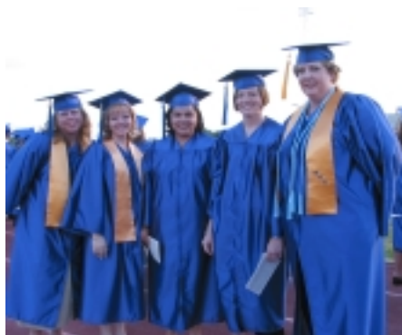
Graduates eagerly wait for the ceremony to begin.