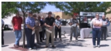
A crowd of city leaders and ENMU-R employees gathered at Pioneer Plaza to celebrate AMT Day.