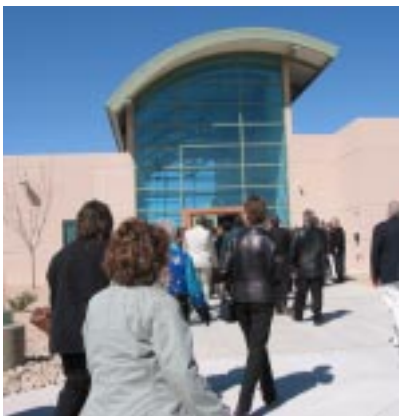
New ILEA Building Entrance