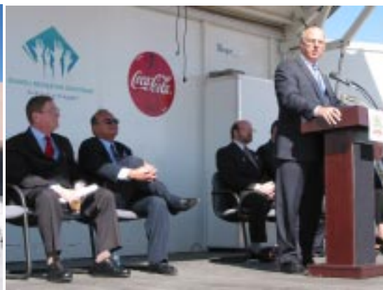
Representative Steve Pearce spoke to the audience.

Below, Senator Domenici enthusiastically leads the tour of the new building.