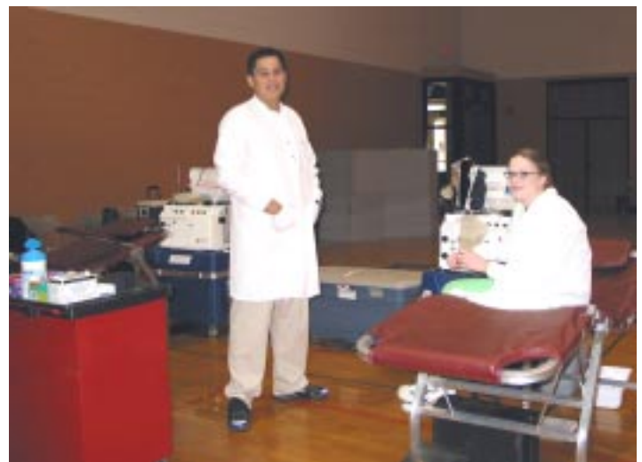
United Blood Services personnel ready their clinic for the ENMU-Roswell campus blood drive held Monday, January 30.