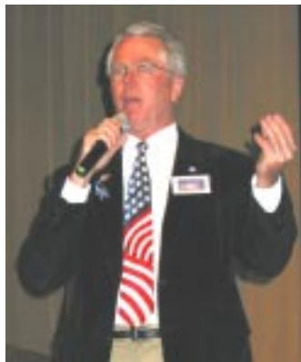
Mayor Bill Owen