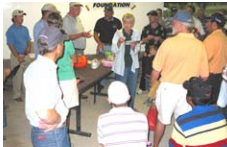
The afternoon flight golfers took shelter from the late rain storm inside the pavillion to claim their prizes.