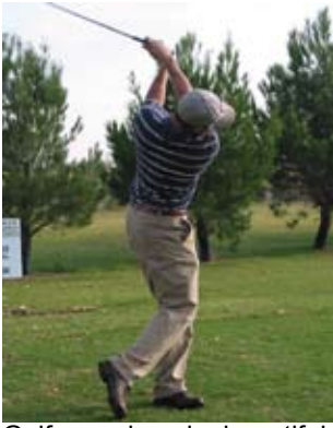
Golfers enjoyed a beautiful day at the Spring River course.