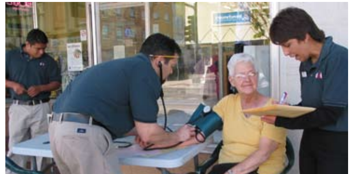
Respiratory Therapy students celebrated World Lung Health Day in Roswell on October 25. The students checked blood pressure and conducted free lung volume tests in front of Uniform Emporium in downtown Roswell.