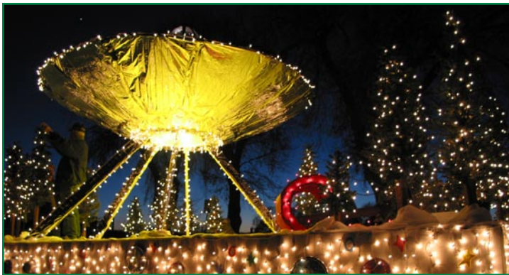
ENMU-Roswell's float featured a glowing UFO, in keeping with the 'Cosmic Christmas' theme of the parade. The campus float won first place in the non-commercial division.