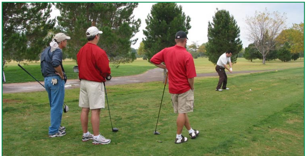
Golfers enjoyed the cool fall weather.