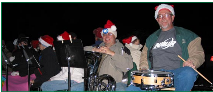
Decked in Santa hats and other warm clothing, members of the ENMU-Roswell Community Band played holiday music during the parade.