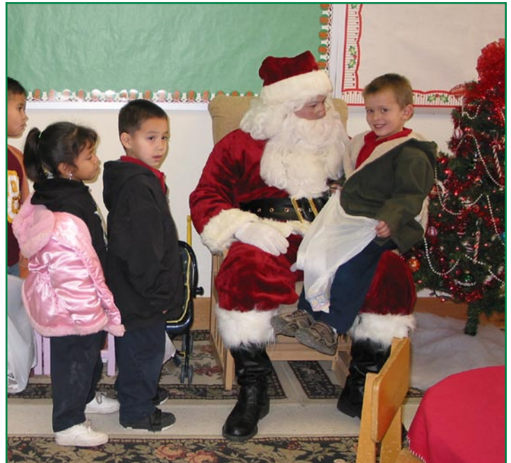
Students from Sunset Elementary School wait in line to visit with Santa Claus during a Christmas party held for the children on December 2. For the past three years the Division of Health, including the Nursing program and the Child Development Center, have sponsored the party for children in grades K-2. More than 175 children participated this year. Hamill Bus Company provided the transportation as a gift to the school and the university.