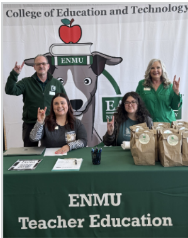
CET faculty and staff at the Teacher Job Fair